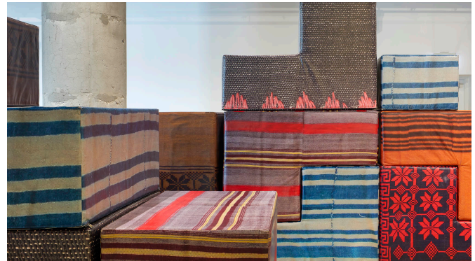
Demos : A Reconstruction , Andreas Angelidakis, 2019, Foam and vinyl seating modules, variable dimensions.